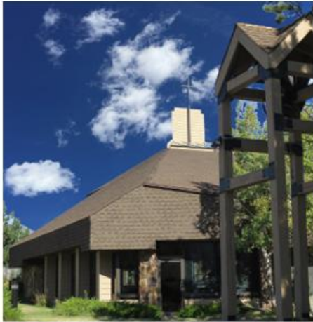
Volume 14, Number 6