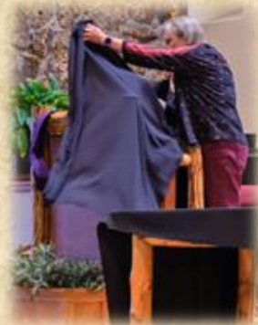
Maundy Thursday Service of Communion