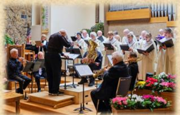
Easter Sunday April 5th