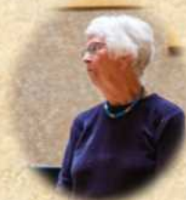
Thanksgiving Donation to Crossroads