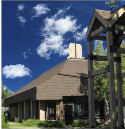
Volume 13, Number 12