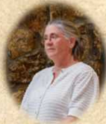
All Saints Day & Honoring our Long-time Members