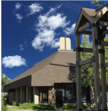
Volume 14, Number 1