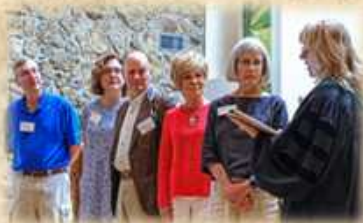
New Member Installation August 10th