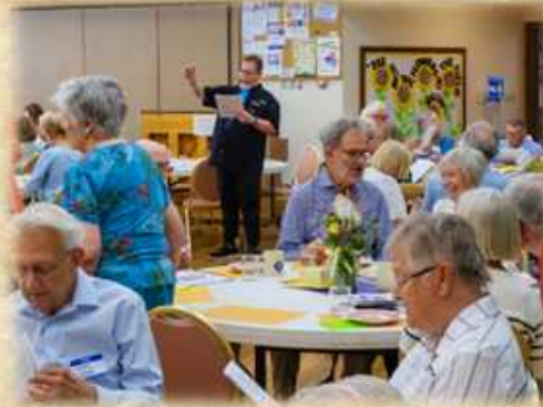
Pie Social and Hymn Sing