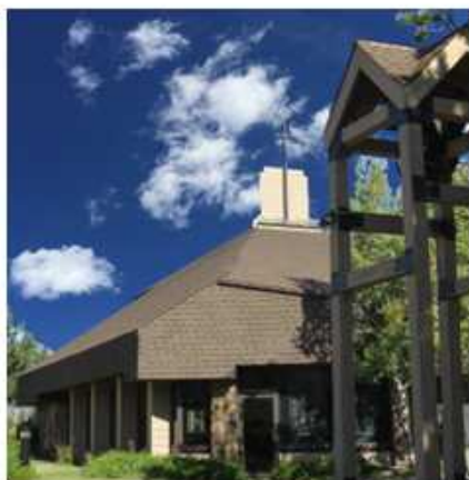
Volume 13, Number 9