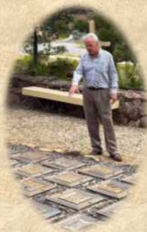
Remembrance at the Columbarium