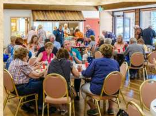
Annual Church Picnic