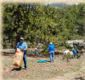
Work on the Kent Dannen Meditation Trail