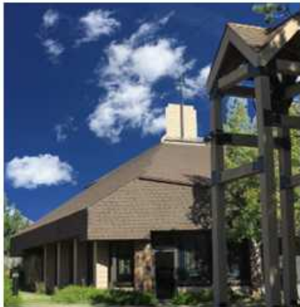
Volume 13, Number 6