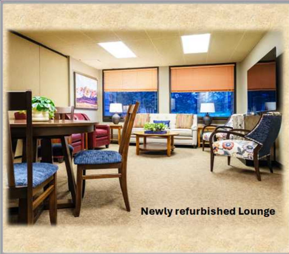
Newly refurbished Lounge

Mission Statement: Presbyterian Community Church of the Rockies is a welcoming community united by faith in Jesus Christ; we seek to serve others, share God's love, and engage all people.