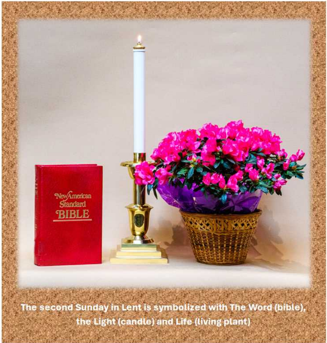
The second Sunday in Lent is symbolized with The Word (bible), the Light (candle) and Life (living plant)