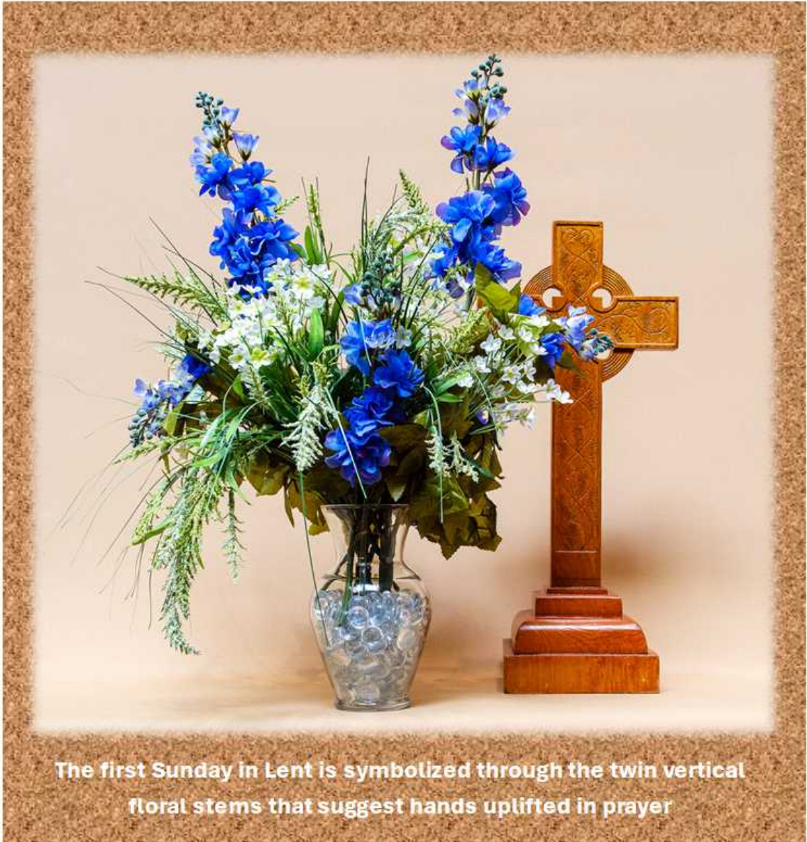
The first Sunday in Lent is symbolized through the twin vertical floral stems that suggest hands uplifted in prayer