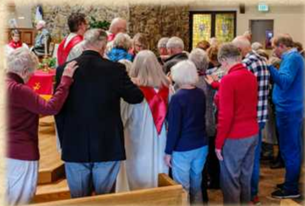
Service of Ordination and Installation of our new Elders and Deacons on January 12th