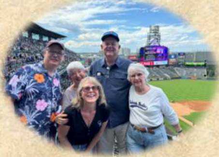
Colorado Rockies fans!