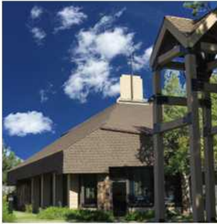
Volume 13, Number 5