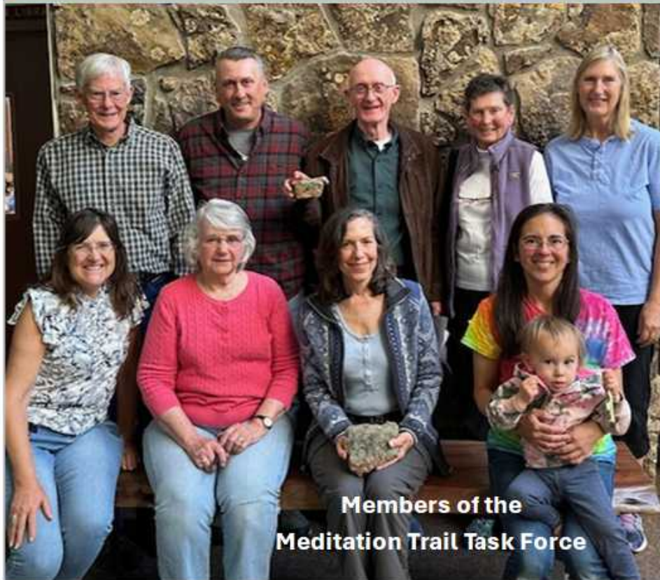
Members of the Meditation Trail Task Force

Mission Statement: Presbyterian Community Church of the Rockies is a welcoming community united by faith in Jesus Christ; we seek to serve others, share God's love, and engage all people.