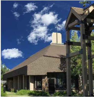
Volume 12, Number 8