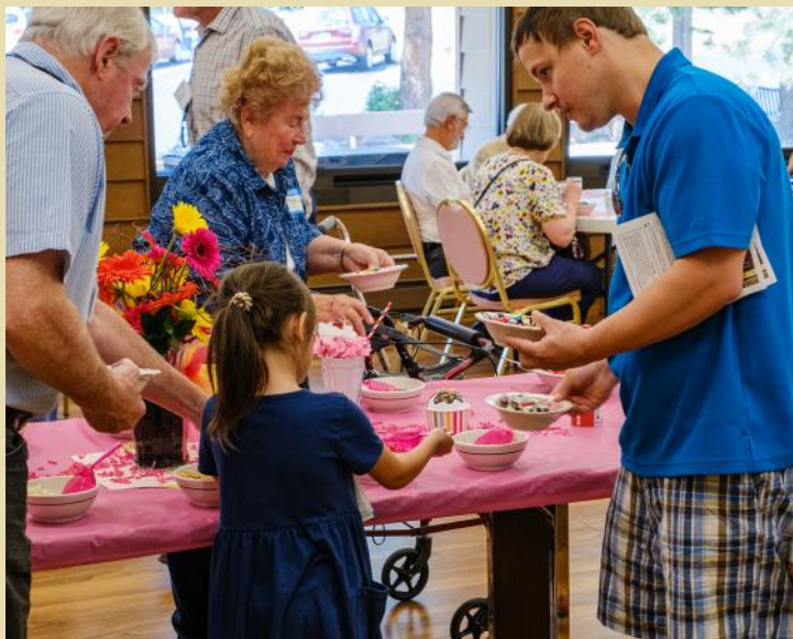
Ice Cream Social On July 30th