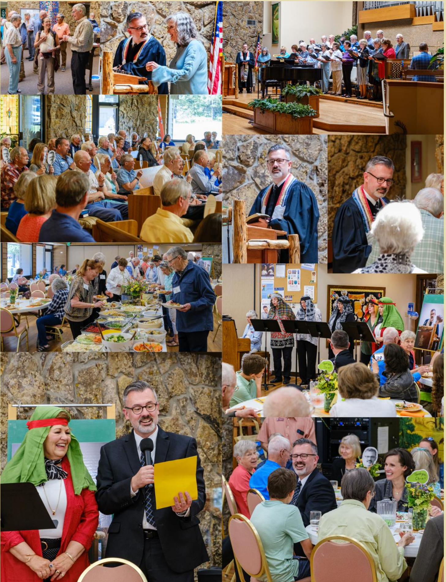
Sunday, June 25th