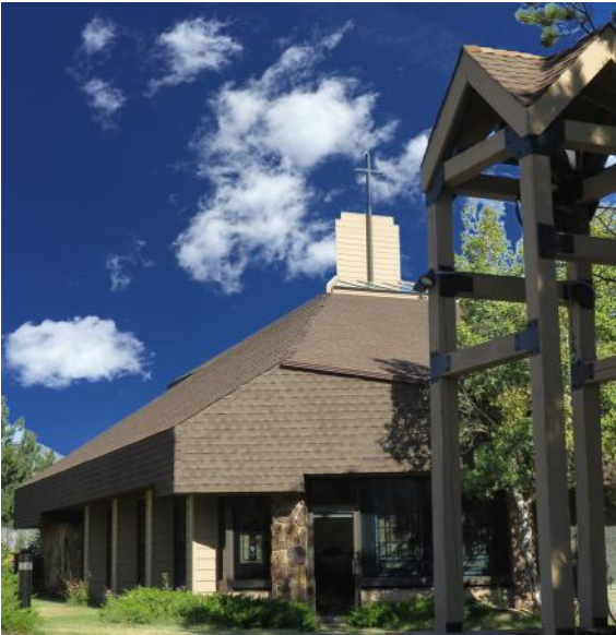
Volume 11, Number 7